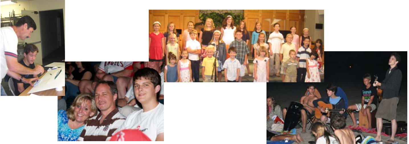
(Left to Right: Watercolor with Pete, Popsicles and Praise, HS Big Beach Wednesday, Big Bang Friday)