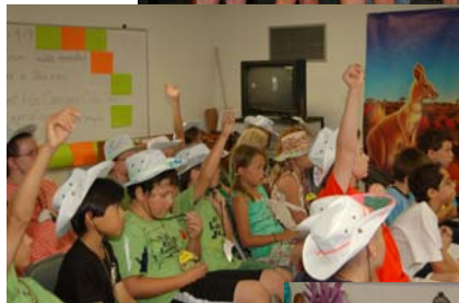
Teaching of God's Word