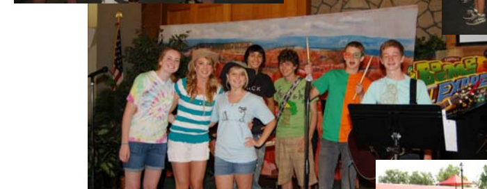
Fun activities for all