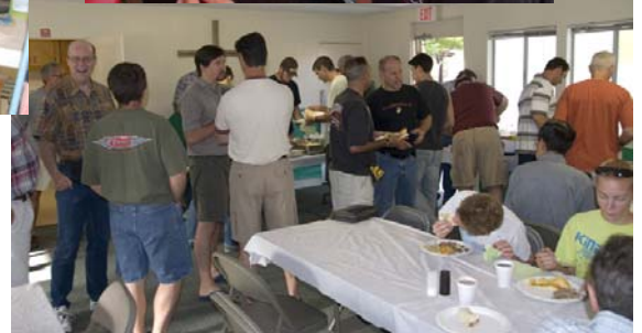
(Clockwise from top right: July 3 rd Celebration Balloon Booth, Men's Breakfast, A Friendly Face at Awana Round-up, Information Kiosk, Father's Day Baptisms, Serve Day with Operation Barnabas Team)